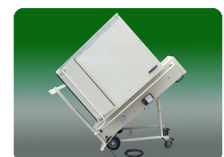
Portable Stage Lifts PSL-50 750 lbs. weight capacity