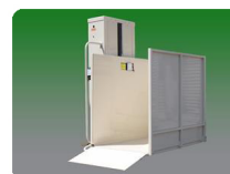
Vertical Home Lifts PL-50 750 lbs. weight capacity