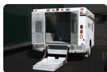
Prison Transport Lifts 750 lbs. weight capacity