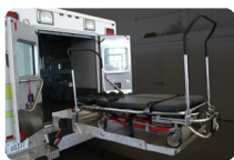
Ambulance Lifts 750, 1,000 and 1,300 lbs. weight capacity