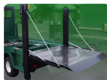
Electric Car Rail Lift 800 lbs. weight capacity