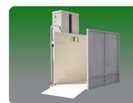
Vertical Home Lifts PL-