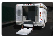
Prison Transport Lifts