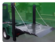
Electric Car Rail Lift