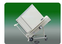
Portable Stage Lifts